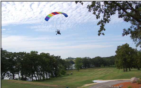
Join us for the Championship Flight Ball Drop. Weather permitting, we will split-the-pot of cash with the winners closest to the hole.